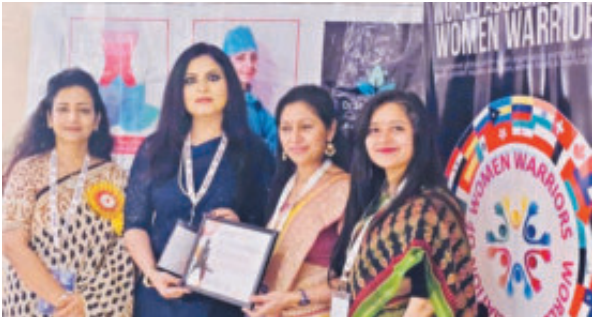
शक्तिकरण और साथीता के लिए समर्पित किया गया।