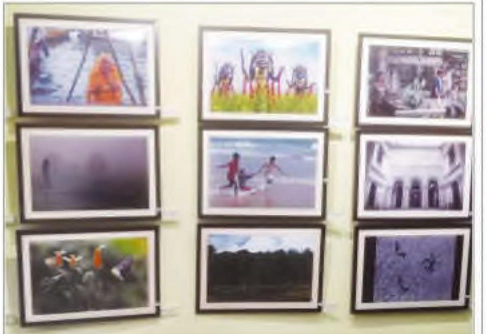
ক্যালকাতা জনাঙ্গিস্টস ক্লাবের পরিচালনায় শুক্রবার থেকে আইসিসিআর প্রেক্ষাগৃহে চিত্র প্রদর্শনী শুরু হল। এই প্রদর্শনী চলবে আগামী রবিবার পর্যন্ত। এই প্রদর্শনীতে প্রায় চারশোরও বেশি ছবি প্রদর্শিত হয়েছে।