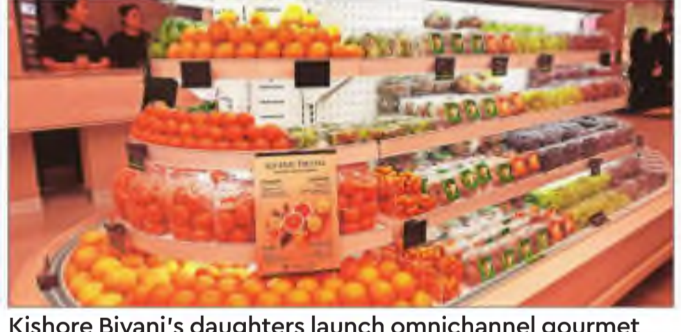
Kishore Biyani's daughters launch omnichannel gourmet food store and cafe

Chau said that India is one of the key markets in VinFast's global expansion strategy. VinFast was established in 2017. It owns an automotive manufacturing complex in Hai Phong, Vietnam.