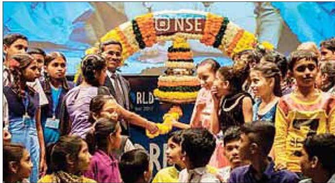
Children at the closing bell ceremony at NSE on Tuesday