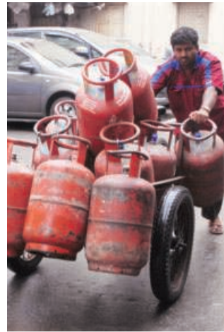
The compensation will allow OMCs to continue meeting critical requirements such as crude and LPG procurement

Despite the losses, public sector oil marketing companies