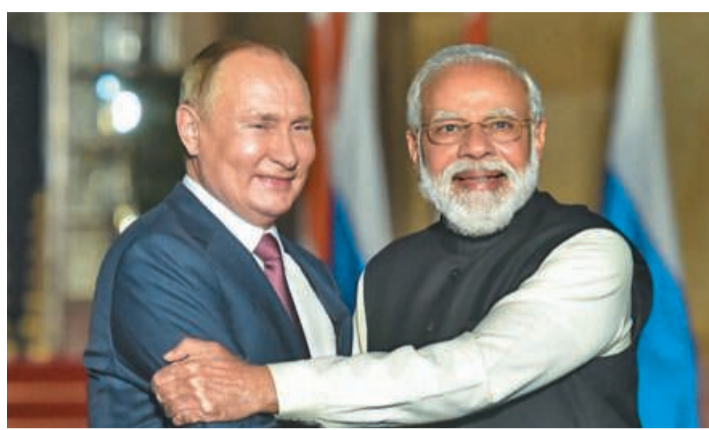
File photo of Prime Minister Narendra Modi (right) with Russian President Vladimir Putin in New Delhi in 2021

Modi spoke with Brazil's President Luiz Inacio Lula da Silva on Thursday, where the two discussed a broad range of issues, including high tariffs that the US has imposed on the two countries. Modi is slated to