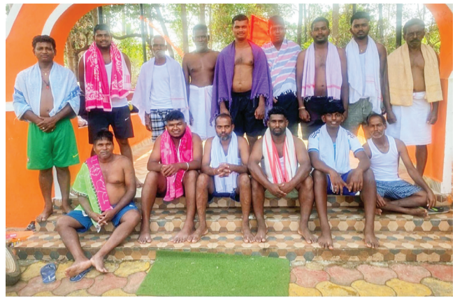
साळ परवारवाडा येथील लडईचे व्रतस्थ धोंड.