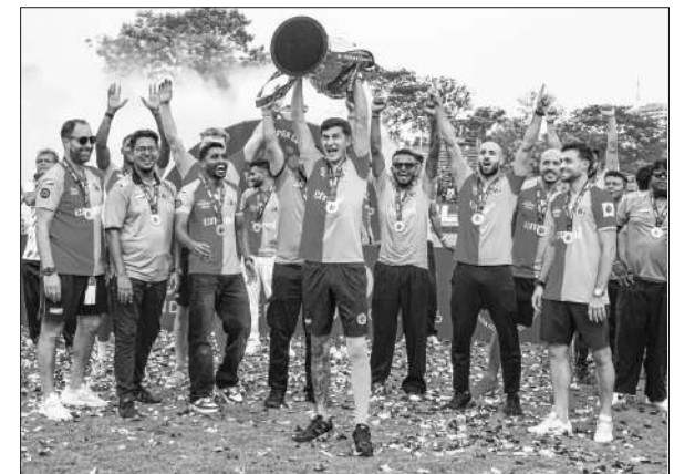
East Bengal FC players celebrate with the ISL 2026 trophy at the club ground on Friday.

The clubs urged the AIFF to work collaboratively towards a framework that is sustainable, inclusive and built with all stakeholders in mind. "Indian football has the foundation to be far greater than it is today. It is therefore disappointing that those who have built, funded, promoted and sustained the league continue to face uncertainty over the very structure," the statement read.