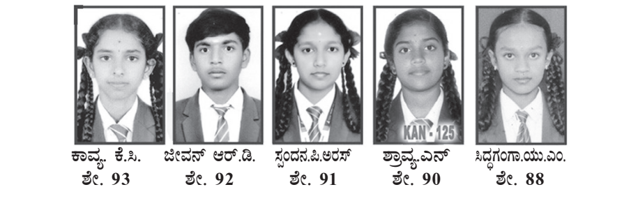
ಕಾವ್ಯ ಕೆ.ಸಿ. ಜೇವನ್ ಆರ್.ಡಿ. ಸ್ವದನ್.ಪಿ.ಆರ್.ಶ್ರೀ. ಶ್ರೀ. 93 ಶೇ. 92 ಶೇ. 91 ಶೇ. 90 ಶ್ರೀಧರಂಗಾಯಿ.ಎಂ. ಶೇ. 88