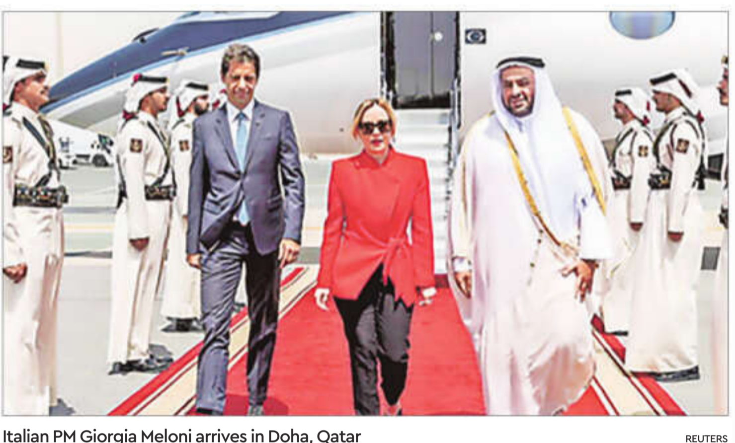
Italian PM Giorgia Meloni arrives in Doha, Qatar