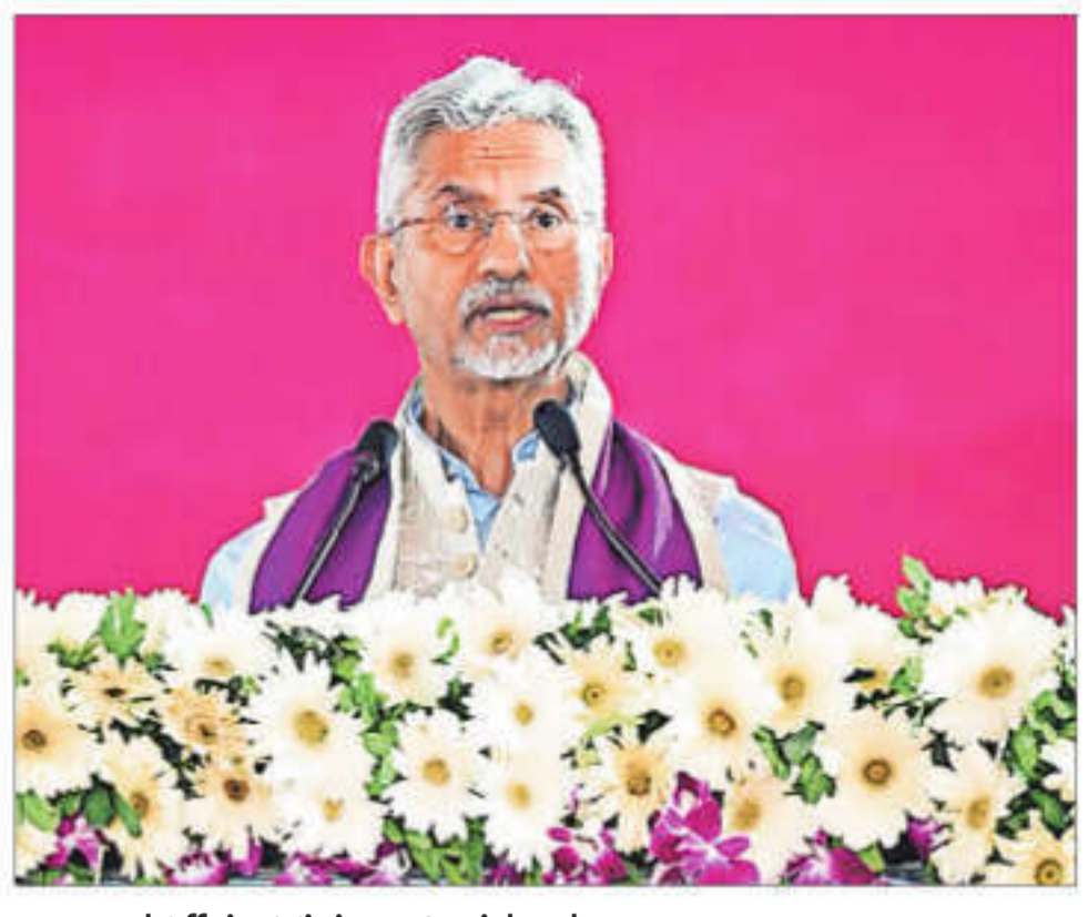
External Affairs Minister S Jaishankar

A GROUP OF stranded Indian fishermen in Iran are returning home through Armenia on Saturday, the government said.