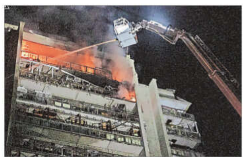
Rescue workers put out a fire of a building damaged following a Russian strike in Ukraine