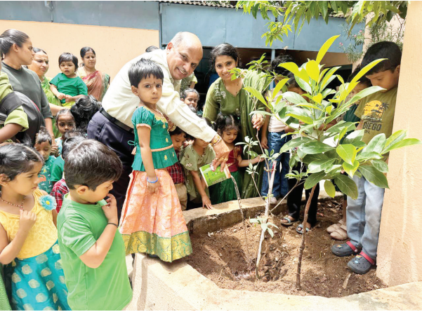
ನಡೆಸುವುದರ ಜೊತೆಗೆ ಪರಿಸರ ಜಾಗೃತಿ ಮೂಡಿಸುವ ಉದ್ದೇಶದಿಂದ ಸಿಕ್ಕಿಗಳನ್ನು ವಿತರಿಸಿದರು.

ಬೆಂಗಳೂರು, ಜೂನ್ 5: ವಿಶ್ವ ಪರಿಸರ ದಿನಾಚರಣೆ ಅಂಗವಾಗಿ ಮೂಡಲಪಾಳ್ಯದಲ್ಲಿ ಶ್ರೀ ಶಾರದಾ ವಿದ್ಯಾ ನಿಕೇತನ ಶಾಲೆಯಲ್ಲಿ ವಿಶೇಷ ಪರಿಸರ ಜಾಗೃತಿ ಕಾರ್ಯಕ್ರಮವನ್ನು ಹಮ್ಮಿಕೊಳ್ಳಲಾಯಿತು.