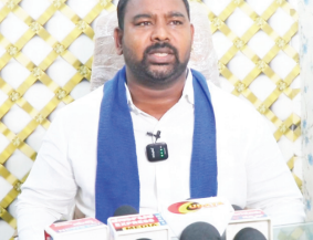
ಸಚಿವ ಸಂಪುಟದಲ್ಲಿ ಸೂಕ್ತ ಸ್ಥಾನಮಾನ ನೀಡುವುದು ಅಗತ್ಯವಾಗಿದೆ ಎಂದು ಅಭಿಪ್ರಾಯಪಟ್ಟರು.