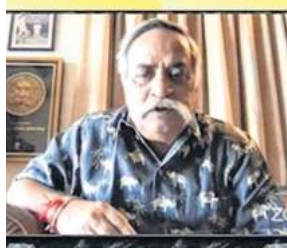
and All-India Management Association (AIMA)-for young people, 'Shaping Young Minds Programme', on Wednesday.

These were the mantras given by leading management gurus on Wednesday while addressing a virtual conference jointly organised by the Indore Management Association (IMA)