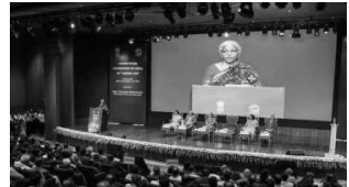
BALANCING ACT. Finance Minister Nirmala Sitharaman addressing the 16th Annual Day Celebrations of the Competition Commission of India in New Delhi on Tuesday https://www.businessline.com

"The CCI works to promote fair competition and prevent competitive practices in the marketplace. Be-