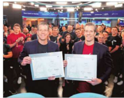
The listing ceremony of a crypto exchange Gemini founded by Cameron and Tyler Winklevoss on September 12

In June, stablecoin issuer Circle Internet Group raised its valuation to $7 billion in the run-up to its IPO. The company's stock listed at $69 apiece, nearly doubling in valuation on debut. Circle's stock closed at $134.19 per share, up over 17 per cent on Monday. The USDC stablecoin issuer's CEO credited engagement with policymakers for