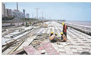
BMC data shows 21,098 trees were felled between 2017-2023 for projects such as Mumbai Metro, Coastal Road among others.

THIS MOVE WILL BE A CRUCIAL TOWARDS CLIMATE RESILIENCE PLANNING IN Mumbai. At present, Mumbai is reeling under the urban heat island effect, where Mumbai's surface temperature has increased significantly with several pockets clocking day time temperatures of 40 degrees Celsius several times during the past three months