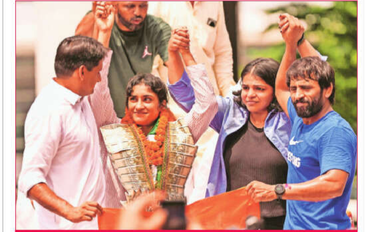
Celebrated wrestler Vinesh Phogat, who endured a heartbreaking exit at the Paris Olympics where she was disqualified for being overweight by 100 gm ahead of finals, receives a grand welcome on her return to the country with hundreds of supporters and other wrestlers showing solidarity with her outside the IGI airport, on Saturday