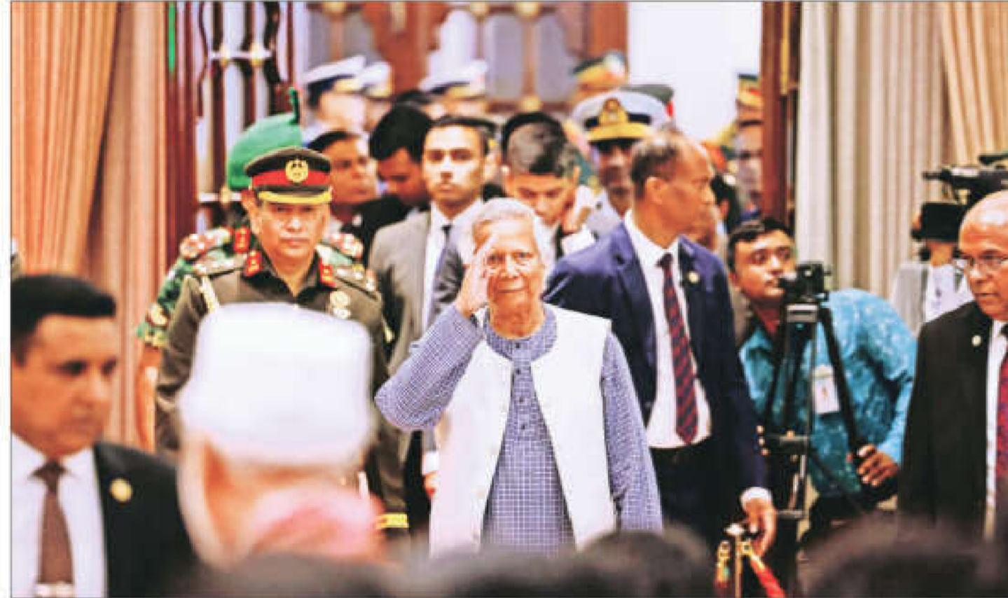
Our task is to carry out vital reforms in electoral system: Chief adviser Yunus

Noting that the current interim government led by him was sworn in on August 8,