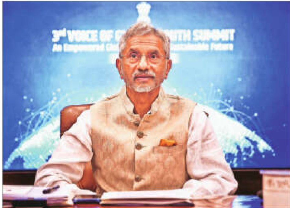
Jaishankar speaks at foreign ministers' session in Delhi

The external affairs minister put across his views in four specific areas of strengthening economic resilience, climate change and energy transitions, revitalising multilateralism and democratising digital transformations. On economic resilience, he said the experience of the Covid-19 pandemic, conflicts and climate events have driven home the necessity for reliable and resilient supply chains.