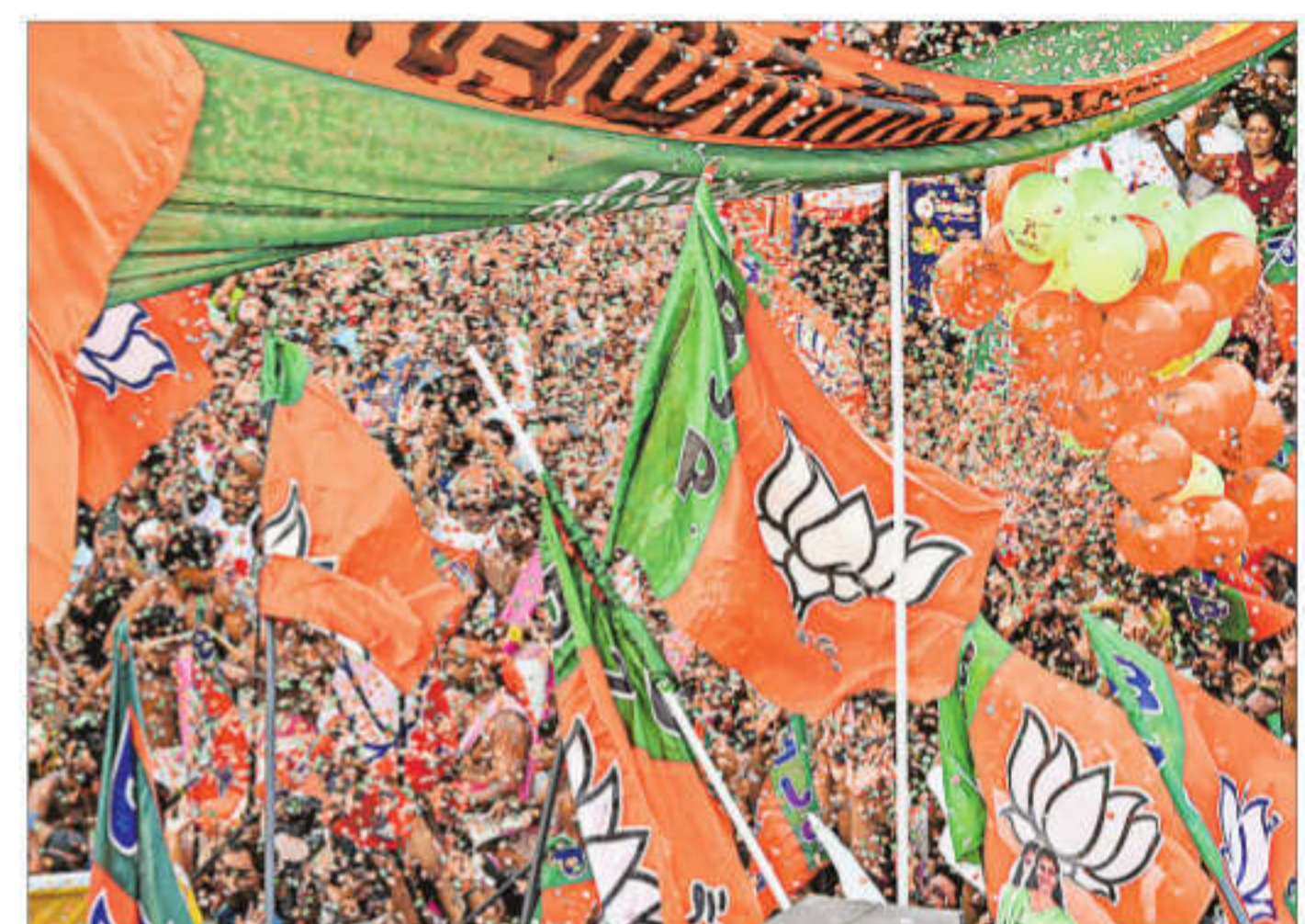
BJP supporters gather on the final day of campaigning for the Kerala Assembly elections, in Thiruvananthapuram on Tuesday