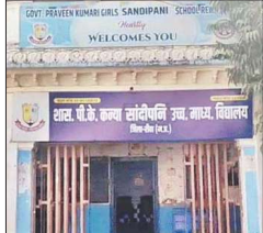
आंध्र प्रदेश सरकार के आदेश पर सादीपनि पीके स्कूल में मेट्रिक के आधार पर प्रवेश प्रक्रिया शुरू होगी।

सादीपनि स्कूलों में निजी स्कूलों के छात्रों के प्रवेश में रोक संबंधी आदेश शासन शिक्षा विभाग द्वारा वापस ले लिया गया है। शासन द्वारा प्रवेश संबंधी रोक हटा दी गई है। शासन के नए आदेश अब सादीपनि विद्यालयों में निजी स्कूलों के छात्र-छात्राओं के प्रवेश का रास्ता साफ हो गया है। नए आदेश के तहत सादीपनि पीके स्कूल में मेट्रिक के आधार पर प्रवेश प्रक्रिया को जारी रखा जाएगा। इसके लिए आज 9 जून से ऑनलाइन प्रवेश प्रक्रिया शुरू होगी। छात्रों को पीके स्कूल में प्रवेश के लिए उसके वेबसाइट में जाकर आवेदन कर सकते हैं।