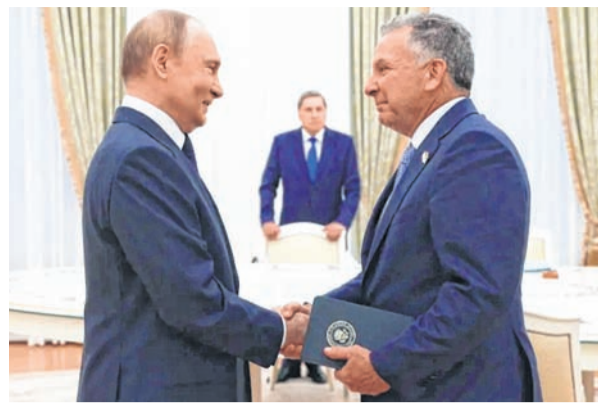
Russia's President Vladimir Putin greets US special envoy Steve Witkoff prior to their talks in Moscow