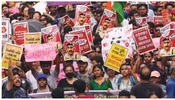
West Bengal Junior Doctors' Forum (WBJDF) supporters during a protest march to Lalbazar, demanding resignation of Kolkata CP in Kolkata on Monday

The participating doctors, who were stopped before guardrails put up by the police on BB Ganguly Street leading to Lalbazar, said that