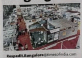
Respedit, Bangalore

expert insights, and certification opportunities to keep participants ahead in this rapidly evolving sector.