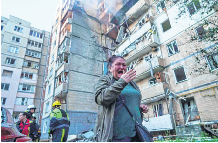
A woman reacts in front of a residential building damaged by a Russian strike in Kyiv, Ukraine on Sunday.

With US-led peace efforts making no headway in recent months, Russia has escalated its aerial barrages of Ukraine. On Sunday, Russia hit the