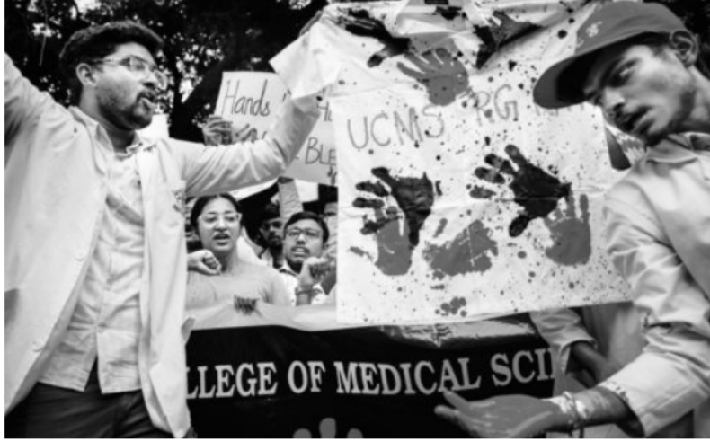
Bengal Chief Minister Mamata Banerjee said the doctors' protest was 'definitely a conspiracy by the Centre and some Left parties'

On Sunday, former bureaucrat and Trinamool's Rajya Sabha member Jawhar Sircar announced that he intended to quit his membership of the Upper House "and also from politics altogether", citing the "faulty handling of the most spontaneous public movement". He also flagged the "increasing strong-arm tactics" of a section of leaders in the Trinamool.