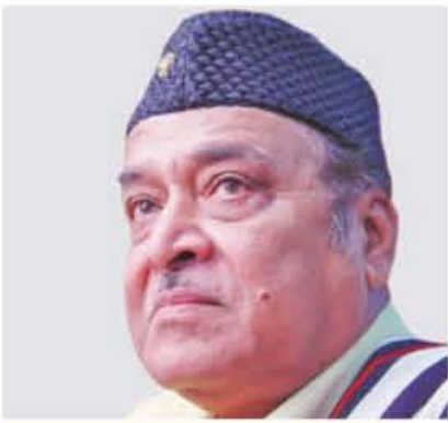
BHUPEN DA TRAVELLED THE GLOBE, RUBBED SHOULDERS WITH THE WHO'S WHO ACROSS ALL SPECTRUMS OF SOCIETY, BUT HE REMAINED DEEPLY CONNECTED TO HIS ROOTS IN ASSAM

Brilliance came to Bhupen Da at a very young age. At the age of just five, he sang at a public event and quickly gained the attention of none other than Lakshminath Bezbaruah, the pioneering figure of Assamese literature. By the time he was a teenager, he had recorded his first song. But music was only one part of his personality. Bhupen Da was as much an intellectual at heart...curious, articulate and driven by an insatiable desire to understand the world. Cultural legends like Jyoti Prasad Agarwala and Bishnu Prasad Rabha left a deep impression on his mind and also deepened his spirit of enquiry. It was also this desire to learn that made him excel at Cotton College, Banaras Hindu University and took him to the United States, where he interacted with lead-