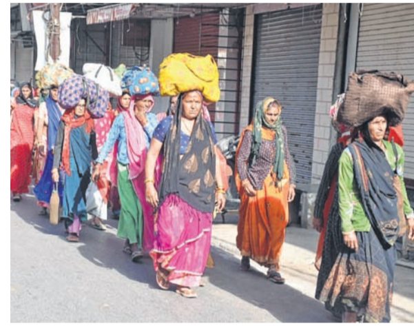
Despite scorching heat, the rural people carrying essential goods on their heads, left for 118-km Panchkrosi Yatra in Ujjain on Monday

The Panchkosi Yatra will formally start from April 23 as per the date. The devotees will complete the journey after travelling 118 kms and returning to the temple of Lord Nagchandreshwar. For years, many people have been starting their journey two days before the scheduled date while some set out as per the date, so this journey which used to last for five days becomes a seven-day journey. The police and administration have started making arrangements for food, drinking water, toilets, roads, tents and devotees’ safety in the Panchkosi Yatra.