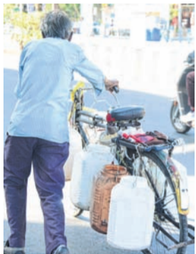
Surendra Palace, and Anand Vihar—where VVIPs reside, have normal water supply, they claimed.

Summer has begun, and around 150-160 residential colonies along Hoshangabad Road are already facing water shortages. Despite some colonies having bulk connections of Narmada water, they continue to struggle due to low water pressure and inconsistent supply. This has made it difficult for residents to meet their daily water needs. The rising temperatures have only worsened the situation by increasing water demand. Most of these colonies fall under Zone-13 of the Bhopal Municipal Corporation (BMC).