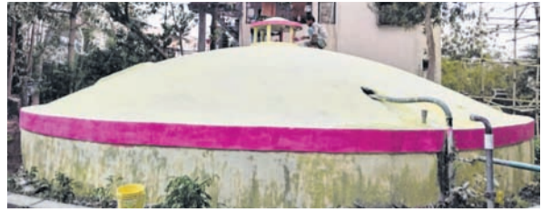
Intake well of Narmada water project