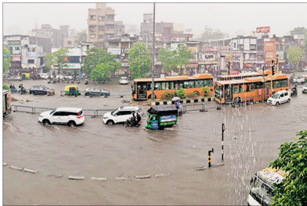
Inundated roads connecting Surat and Navsari cripples traffic movement on them; (left) a school student wades through knee-deep water in Surat's Limbayat on Tuesday.