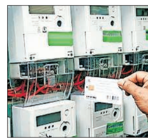
Ombudsman upheld Madhya Gujarat Vij Company Limited's decision to replace a Vadodara businessman's existing meter & then disconnect supply over unpaid dues of Rs 235