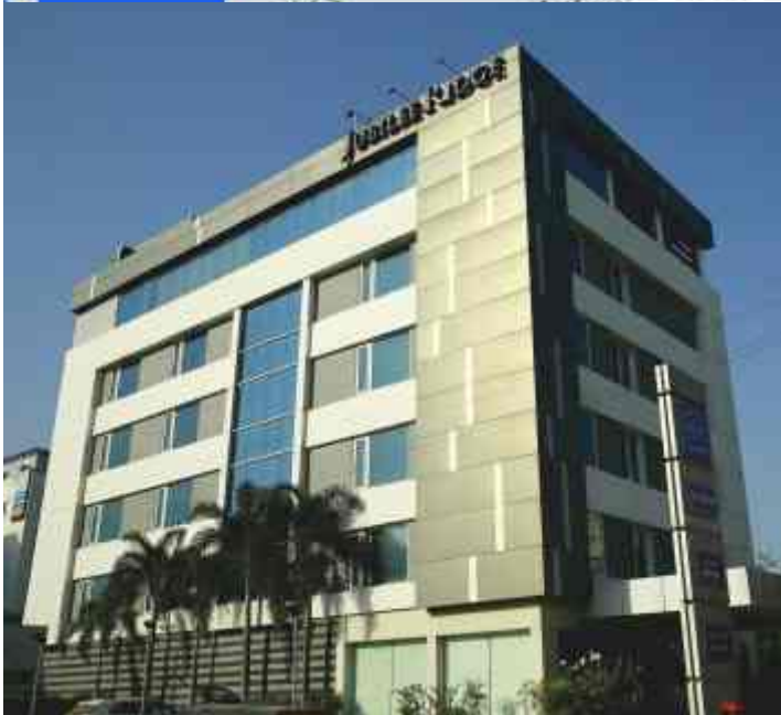
Hotel Jubilee Ridge

📍 Extension, Plot No. 38 & 39, Rd Number 36, Kavuri Hills, Jubilee Hills, Madhapur, Telangana 500033