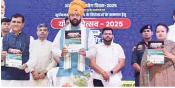
मुख्यमंत्री नायब सिंह सैनी पंचकुला में आयोजित योग महोत्सव-2025 के दौरान पुस्तिका का विमोचन करते हुए, साथ में हैं आयुष मंत्री आरती सिंह राव।

को पंचकुला में आयोजित योग महोत्सव के दौरान की। इससे पहले, मुख्यमंत्री ने विशेष रूप से 'सूर्य नमस्कार अभियान 2025' के 264 उत्कृष्ट प्रदर्शन करने वाले प्रतिभागियों को सम्मानित किया। इस मौके पर स्वास्थ्य एवं परिवार कल्याण और आयुष मंत्री कुमारी आरती सिंह राव भी उपस्थित रहें।