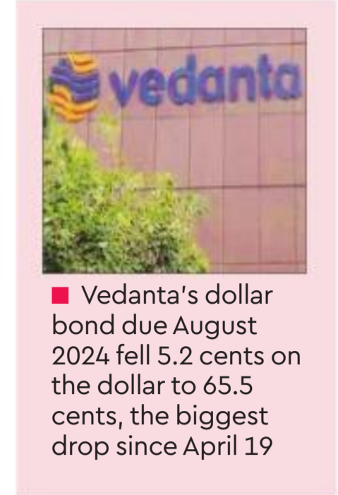
Vedanta's dollar bond due August 2024 fell 5.2 cents on the dollar to 65.5 cents, the biggest drop since April 19

ALL THE FOUR outstanding dollar bonds of Vedanta Resources plunged Wednesday after report said banks have informally approached some investors for a potential exchange offer on some of the firm's notes. On Monday, Foxconn decided to part ways with Vedanta on a planned semiconductor JV. Vedanta later said it remains committed to the chip project, raising concerns it may further stretch the company's finances. Foxconn, on the other hand, plans to apply for India government incentives for chip and display manufacturing and reviewing options for partners. Vedanta Resources dollar bond due August 2024 fell 5.2 cents on the dollar to 65.5