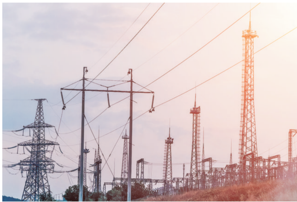
Electricity subsidies: Who benefits and who pays? ('000 crore)

challenge then is to pursue this without financially crippling electricity distribution companies (discoms). The figure shows the true economic subsidy (the gap between cost and price), and how it has been financed since FY18. It comes from four sources: Explicit budgetary subsidy transfers, higher tariffs on commercial and industrial users (the so-called cross-subsidy), central and state government grants, and discom losses. What is commonly reported as the "power subsidy" (₹2.1 trillion) captures only the first of these. The rest are hidden. The term "cross-subsidy" itself is Orwellian. It is, in effect, a punitive tax on economic activity. Because some consumers are charged well below cost, discoms compensate by charging industrial and commercial users well above cost. There has been some progress. Discom losses have declined recently. The share of subsidies funded through explicit budgets has increased, and reliance on cross-subsidies has declined. But the remaining tax burden is still large (about 50 per cent above efficient cost), and it continues to undermine the competitiveness of Indian manufacturing. Successive reforms have tried to fix this. The Electricity Act of