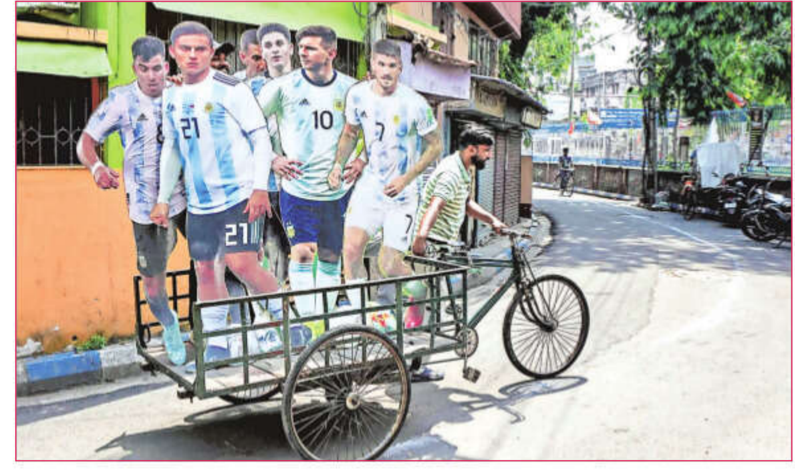
Fans carry a giant bamboo-framed display featuring images of Lionel Messi and other Argentina players on a rickshaw in Kolkata on Friday, amid the ongoing FIFA World Cup 2026.