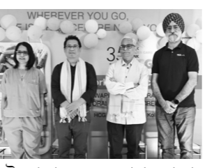
এই রোগের অন্যতম প্রধান কারণ। মুখগহ্বর পরীক্ষা শিবিরে মুখগহ্বর ও মাথা-ঘাড় অঞ্চলে ক্যান্সারের সন্ধান প্রাথমিক লক্ষণ শনাক্ত করার

কলকাতা, ৩০ মে, ২০২৬: বিশ্ব তামাকবিরোধী দিবস উপলক্ষে এইচসিজি কলকাতার হাঙ্গার হাউসে, কলকাতার উদ্যোগে হাঙ্গার হাউসে সংলগ্ন বিভিন্ন শিক্ষাপ্রতিষ্ঠানের ছাত্রছাত্রী ও শিক্ষকদের নিয়ে একটি সচেতনতামূলক কর্মসূচি এবং মুখগহ্বর পরীক্ষার আয়োজন করা