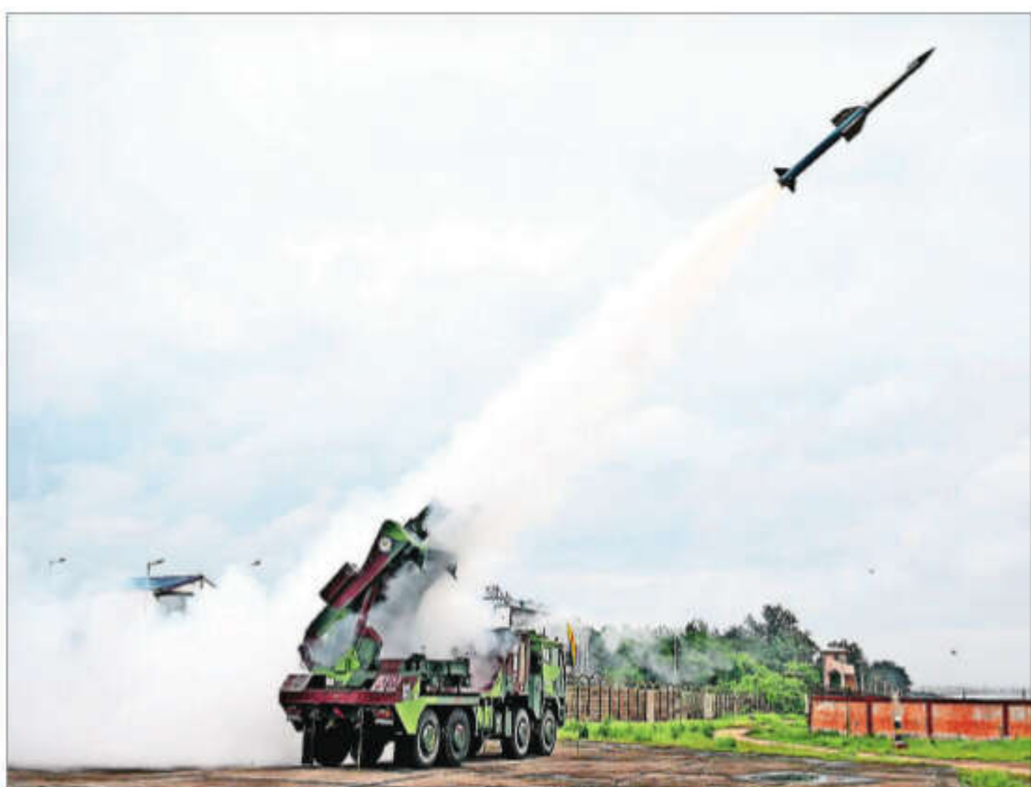
DRDO conducts the maiden flight tests of the Integrated Air Defence Weapon System off the coast of Odisha

The shield is expected to offer multiple layers of protection by combining surveillance, cybersecurity, and air defence systems to detect and