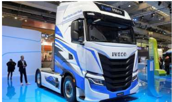
GLOBAL REACH. Iveco will gain access to TML's distribution network across India, South Asia, Africa and parts of West Asia

Rather than pursuing a traditional merger centred on cost-cutting, TML's strategy is to create new revenue opportunities by giving each company access to products, markets and distri-