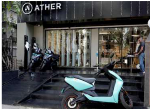
SALES VOLUME. The company sold about 79,251 vehicles during the quarter

Ather's revenue continues to be driven entirely by sales