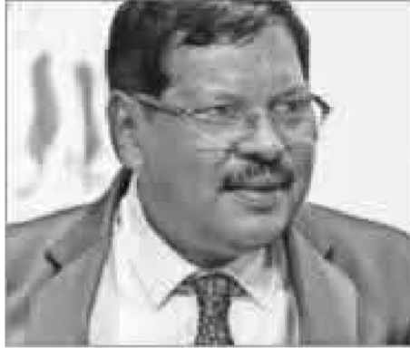
CJI BR Gavai

JUSTICE IS NOT a privilege of the few but a right of every citizen, Chief Justice of India B R Gavai said on Saturday, while emphasising that it is the duty of judges and lawyers to ensure that the light of justice reaches even the last person standing at the margins of society. Addressing the inaugural function of a national conference on strengthening legal aid delivery mechanisms at the Supreme Court premises, Gavai said the true reward of the legal services movement does not lie in statistics or annual reports, but in the quiet gratitude and renewed faith of citizens who once felt invisible.