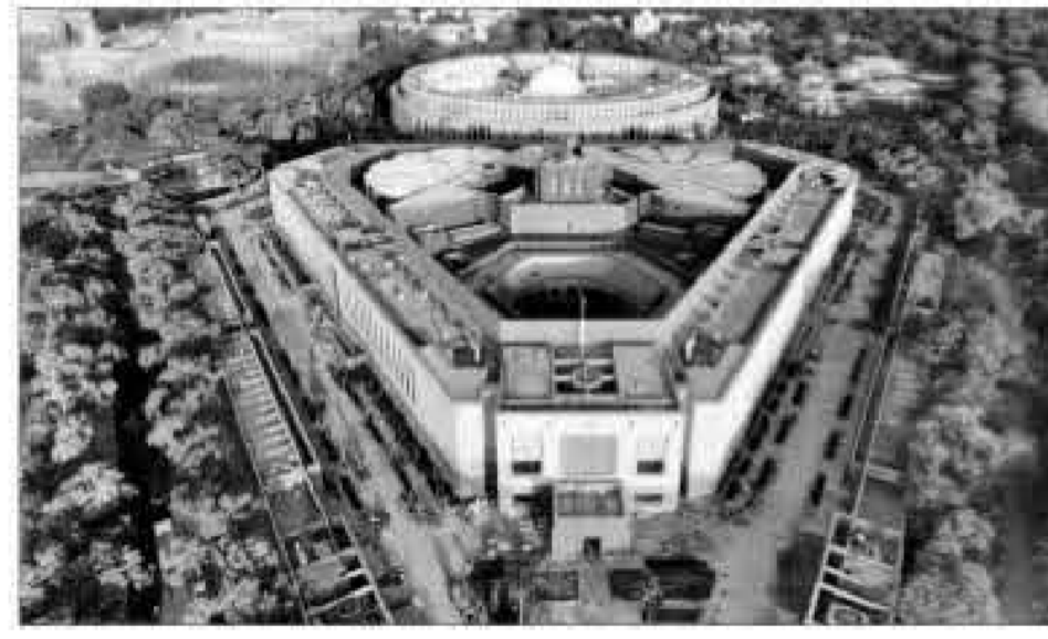
Bihar polls results and US President Donald Trump's Indo-Pak claims to set the tone for the session

The Monsoon session of Parliament also saw vociferous protests by