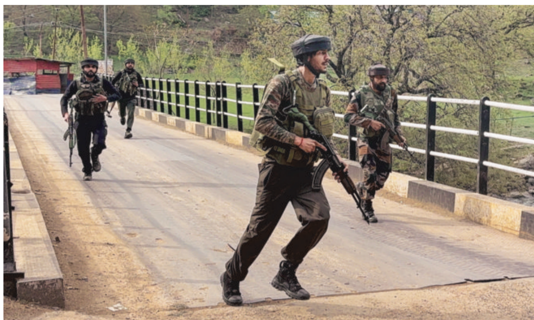
Security personnel in action after terrorists attacked a group of tourists in Pahalgam on Tuesday

A massive anti-terrorist operation has been launched to hunt down the assailants and security forces have