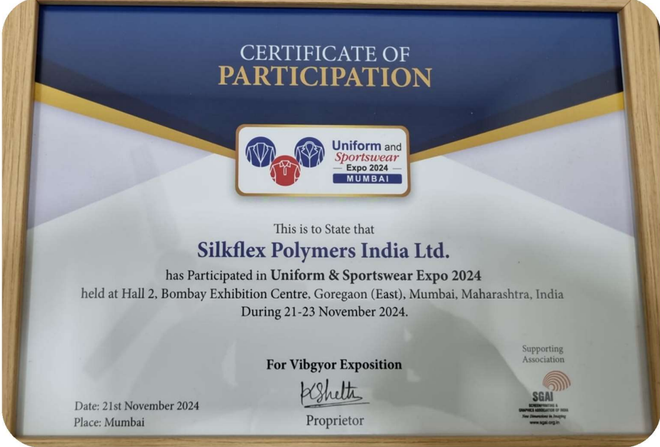
Felicitations for successful participation at Uniform & Sports Wear/Daily Wear Expo Mumbai – 2024