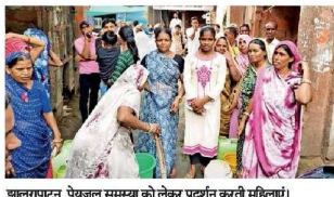
झालावाड़, पेयजल संकट को लेकर प्रदर्शन करती महिलाएँ।

शहर के लंका गेट के समीप स्थित गुर्जर मोहल्ले में पिछले चार माह से पेयजल और बिजली संकट ने लोगों का जीवन पुश्तकार बना दिया है। हलात ऐसे है कि पीने के पानी जैसी बुनियादी जरूरत पूरी करने के लिए भी लोगों को दूरे मोहल्लों का सफ़र लेना पड़ रहा है। मोहल्ले के 40 घरों में जलबंद समस्या है।