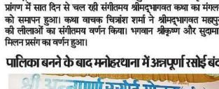
भागवत कथा का समापन, शोभायात्रा में पुष्पवर्षा