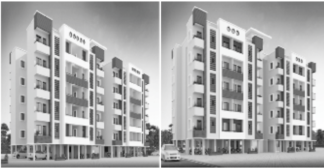
* Perspective view of the ongoing project.

The details of the project are as below :