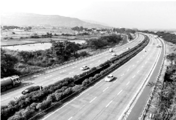
* Present view of the ongoing project site.