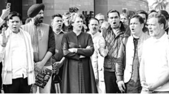
Congress MPs protest against the suspension of eight MPs during the Budget session of Parliament, in New Delhi on Tuesday

The chair then called out the names of other speakers even as Gandhi kept standing. While three Opposition MPs