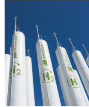
The incentives are part of the ₹17,490-crore Sight scheme.

The decision was taken on Thursday after Jindal India missed the 3 February deadline to furnish bank guarantees required to formally sign up for the scheme, this person said, asking not to be named.