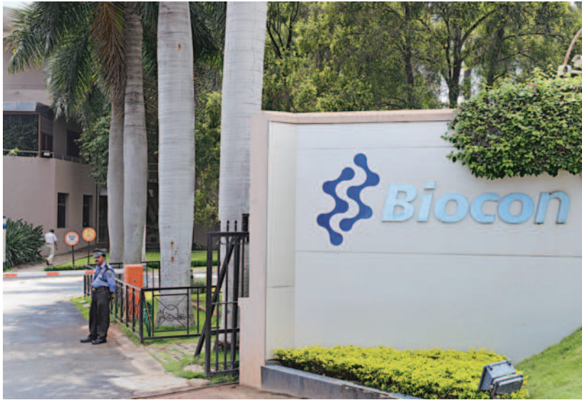
Biocon's net debt had risen to $1.9 billion in December 2022, as it sought funds to complete the purchase of American drugmaker Viatrix's generics portfolio.

the middle of a $500-million capex plan for the generics business, which is currently witnessing a slowdown.