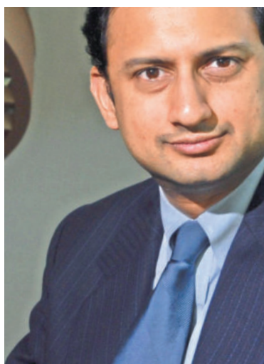
Former Reserve Bank deputy governor Viral Acharya.

Acharya has for the first time publicly disclosed in his prelude the series of events that led to the differences between RBI and the government that he had first hinted while delivering his speech at the A.D. Shroff Memorial Lecture in late 2018. "Creative minds in the bureaucracy and the government" devised a plan to transfer substantial sums accumulated by RBI during tenure of previous governments to the current government's account, he said in the prelude. This new prelude is in the updated edition of his book, first published in 2020. It has been exclusively shared with Mint .