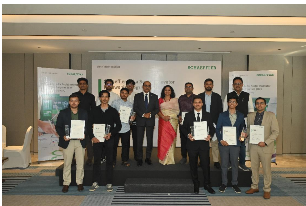
Caption: The winners of the Schaeffler Social Innovator Fellowship Program, 2025

Beyond this fellowship, Schaeffler India continues to drive social development through targeted initiatives such as promoting STEM education in underserved areas, advancing water conservation, encouraging agroforestry and climate-resilient agriculture, and supporting community health projects. Through these initiatives, the company envisions creating an ecosystem where innovation and sustainability converge, ensuring equitable progress and positive transformation in society.