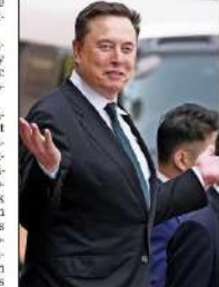
Chinese technology at the Brookings Institution.

In China, Elon Musk has been the object of love-and-occasional loathing. The Tesla boss has been both lauded as a visionary and criticised by Chinese commentators and the public for the alleged bungling of customer complaints.