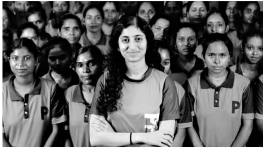
प्रॉटो की कवायद और डीपीडीपी अधिनियम के क्रियान्वयन से जुड़े सवाल

एक वरिष्ठ सरकारी अधिकारी ने कहा कि प्रॉटो और अन्य स्टार्टअप इकाइयों के साथ-साथ कंपनियों द्वारा अपने एआई मॉडल प्रशिक्षित करने के लिए ऐसे डेटा के इस्तेमाल की खबरों के बाद इलेक्ट्रॉनिक्स एवं सूचना प्रौद्योगिकी मंत्रालय इन सेवा मॉडल की वैधता की जांच कर सकता है और यह पता लगा सकता है कि क्या कहीं वे डीपीडीपी अधिनियम के किसी प्रावधान का उल्लंघन तो नहीं करते हैं। अधिकारी ने कहा, 'हालांकि (डीपीडीपी) अधिनियम और इसके नियम दोनों अधिसूचित हो