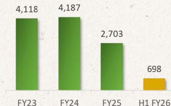
EBITDA (INR Mn)