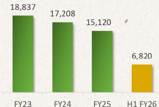
Income (INR Mn)