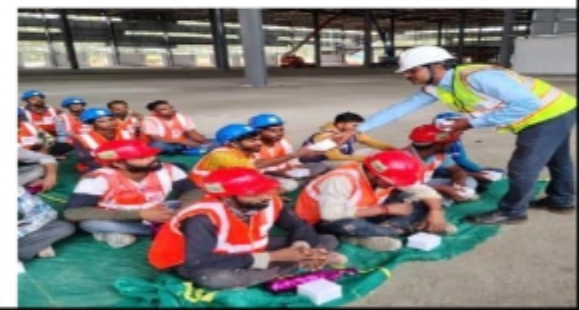
Prizes and sweets distribution on the occasion of Motivational Program