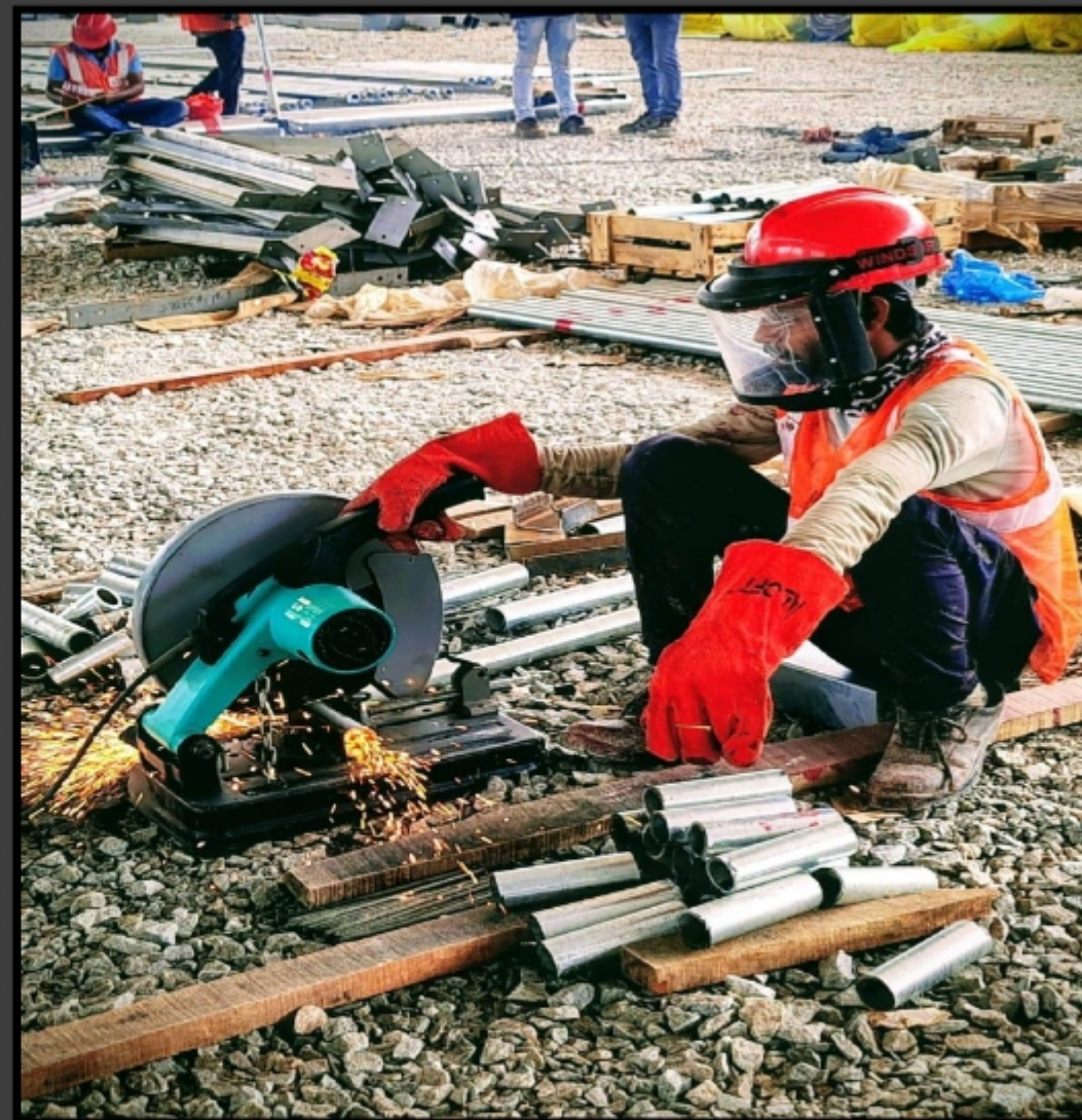
Pipe Cutting with proper PPEs and Suitable Fire extinguisher