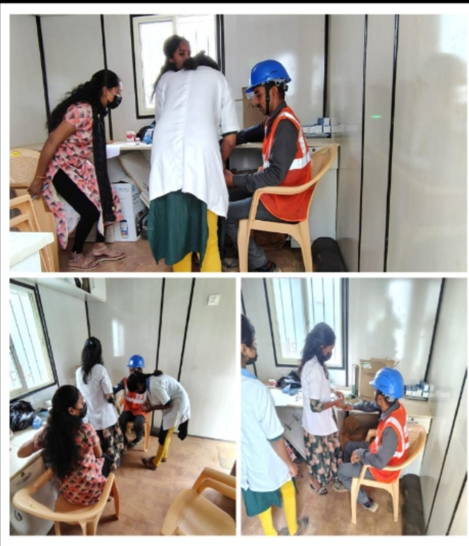
First aid centre and vertigo test