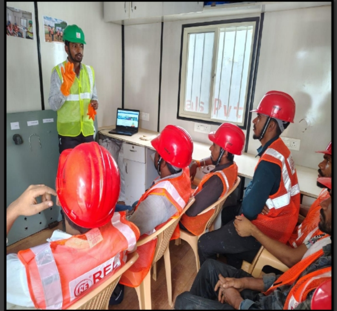
Specific task based training