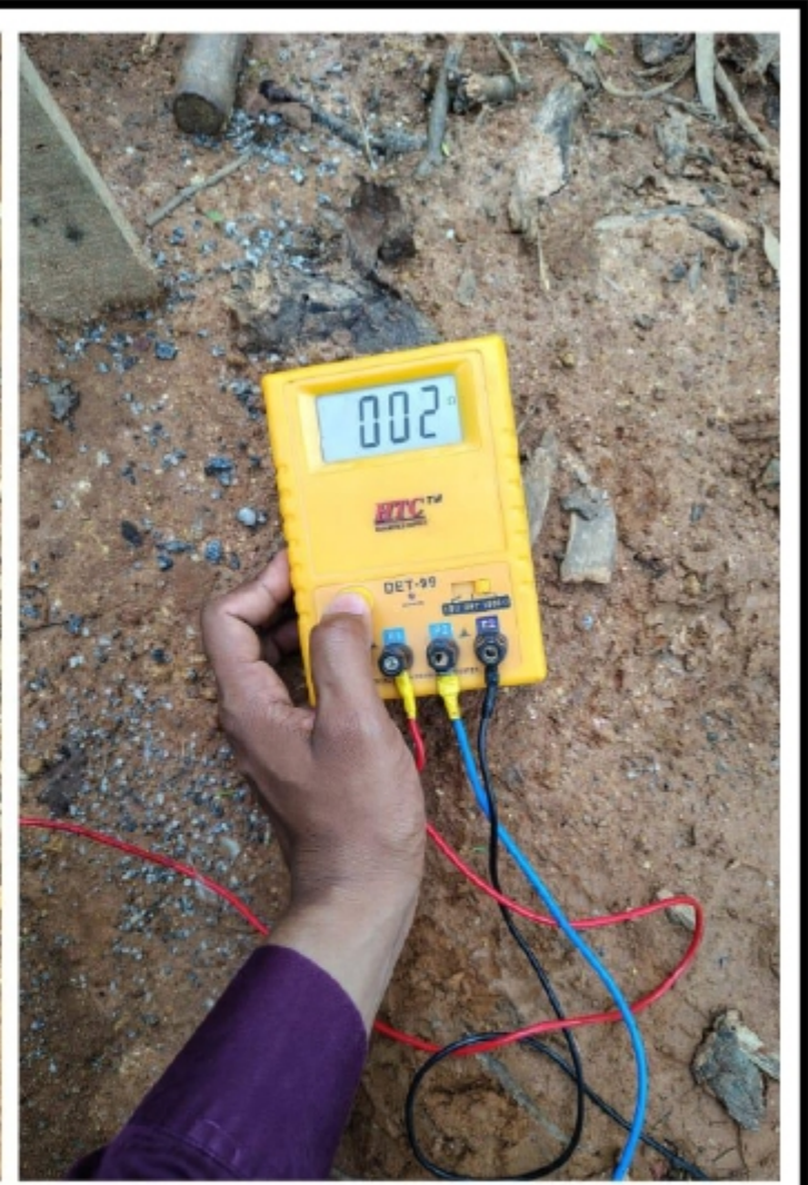
Temporary DB and Earth pit Testing