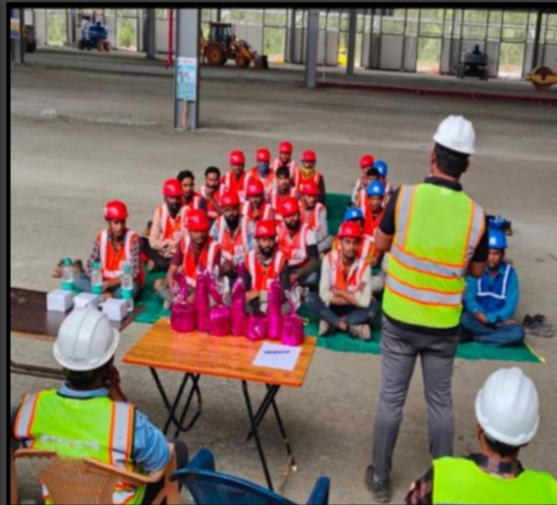
Safety Motivational Program