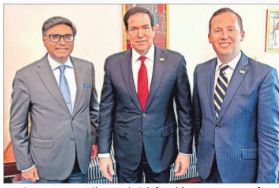
Foreign Secretary Vikram Misri (left) with US Secretary of State Marco Rubio and US Ambassador to India Sergio Gorr (right). The three officials met in Washington on Thursday.

● US diplomat discusses trade, Quad with Misri PRESS TRUST OF INDIA Washington, April 10