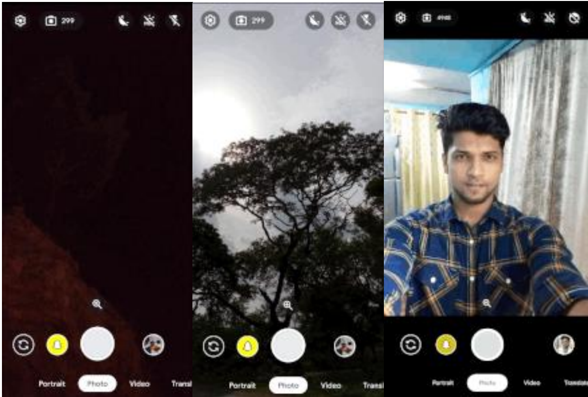
Image 1: Clearer photos in low light with Night mode; Image 2: Photos have wider dynamic range with HDR mode; Image 3: Snapchat Lenses bring Indian-specific effects to your selfies

A great camera: A fast, high-quality camera is a must-have feature for today's smartphone users, so Google and Jio's teams have partnered closely to build an optimized experience within the phone's Camera module resulting in great photos and videos: from clearer photos at night and in low-light situations to HDR mode that brings out wider color and dynamic range in photos, these are firsts for affordable phones in India. Google has also partnered with Snap to integrate Indian-specific Snapchat Lenses directly into the phone's camera, and we will continue to update this experience.