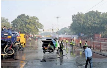
MCD workers clean the spot where a blast took place near the Red Fort (left). People commute on Netaji Subhash Marg following its reopening on Saturday.

Traffic resumed on Netaji Subhash Marg after days of curbs following the blast, Lal Qila Metro gates also reopened