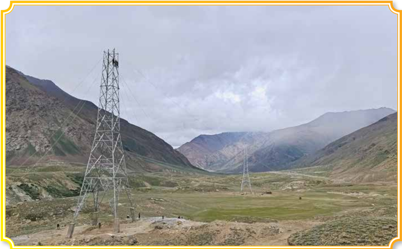
220kv Single Circuit Transmission Line from Drass to Padum on Double Circuit Tower at Kargil, Ladakh being implemented by RECPDCL

All policies & processes are reviewed by the Board of Directors/Senior Management from time to time.